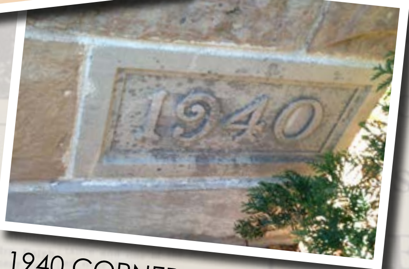
1940 CORNERSTONE containing a time capsule of relevant artifacts from those members of our Lourdes family on whose shoulders we have built our future.