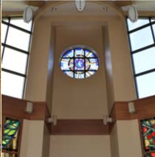
Stained glass donated by the LHS Class of 1993. The glass was removed from the old high school (pictured on the left), modified and installed in the new high school chapel (pictured on the right).