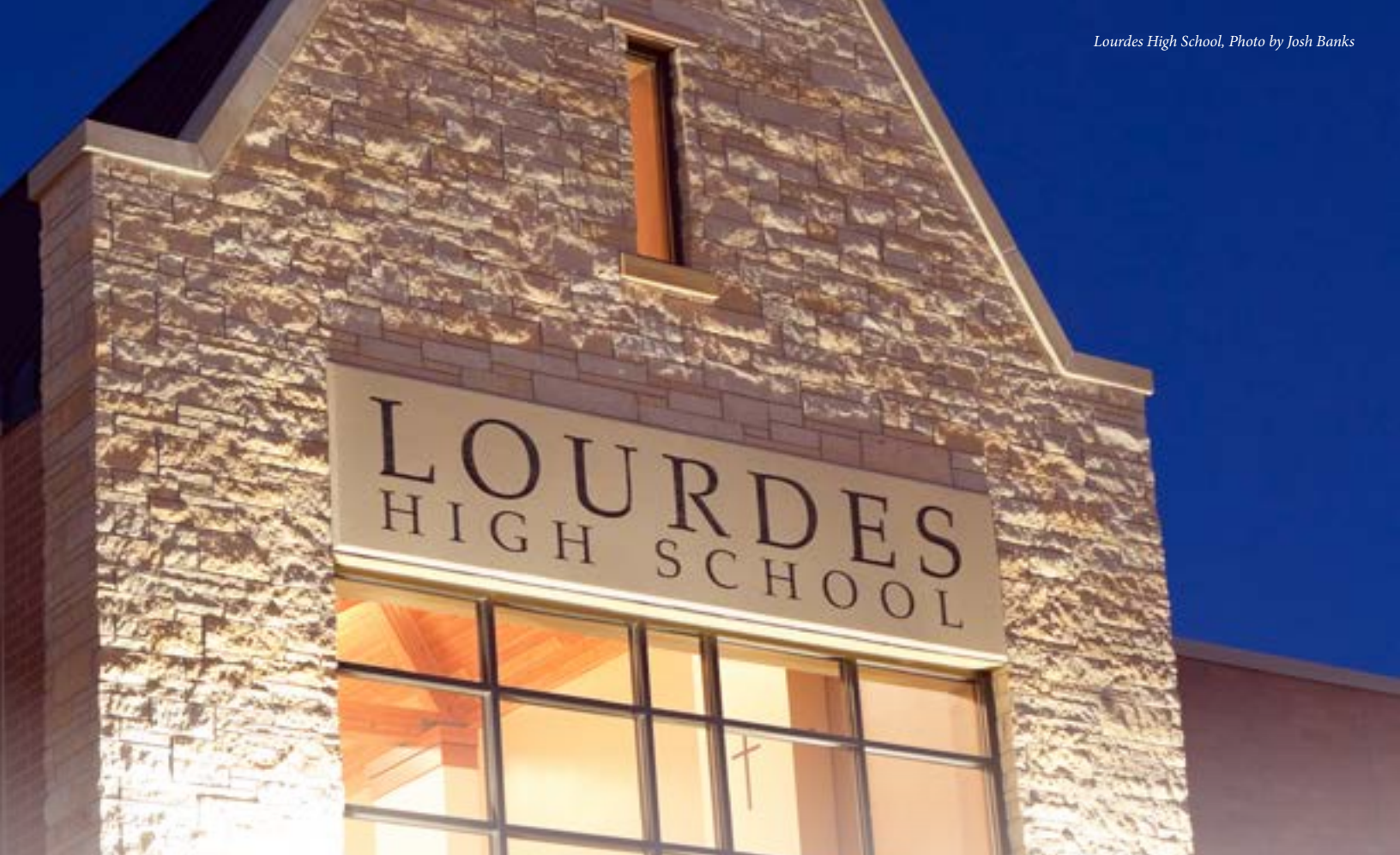
Lourdes High School

Rochester Catholic Schools gratefully acknowledges more than 1,600 donors whose gifts and pledges of support have made this transformational dream a reality. The legacy is so much more than a monetary gift – it is the fulfillment of cultivating young lives of faith, the opportunity for an education, instilling lifelong Christian values and the endowment of a philanthropic spirit in those touched by the generosity of so many. Students of today carry on your legacy by supporting causes that touch their hearts as this high school has touched yours.